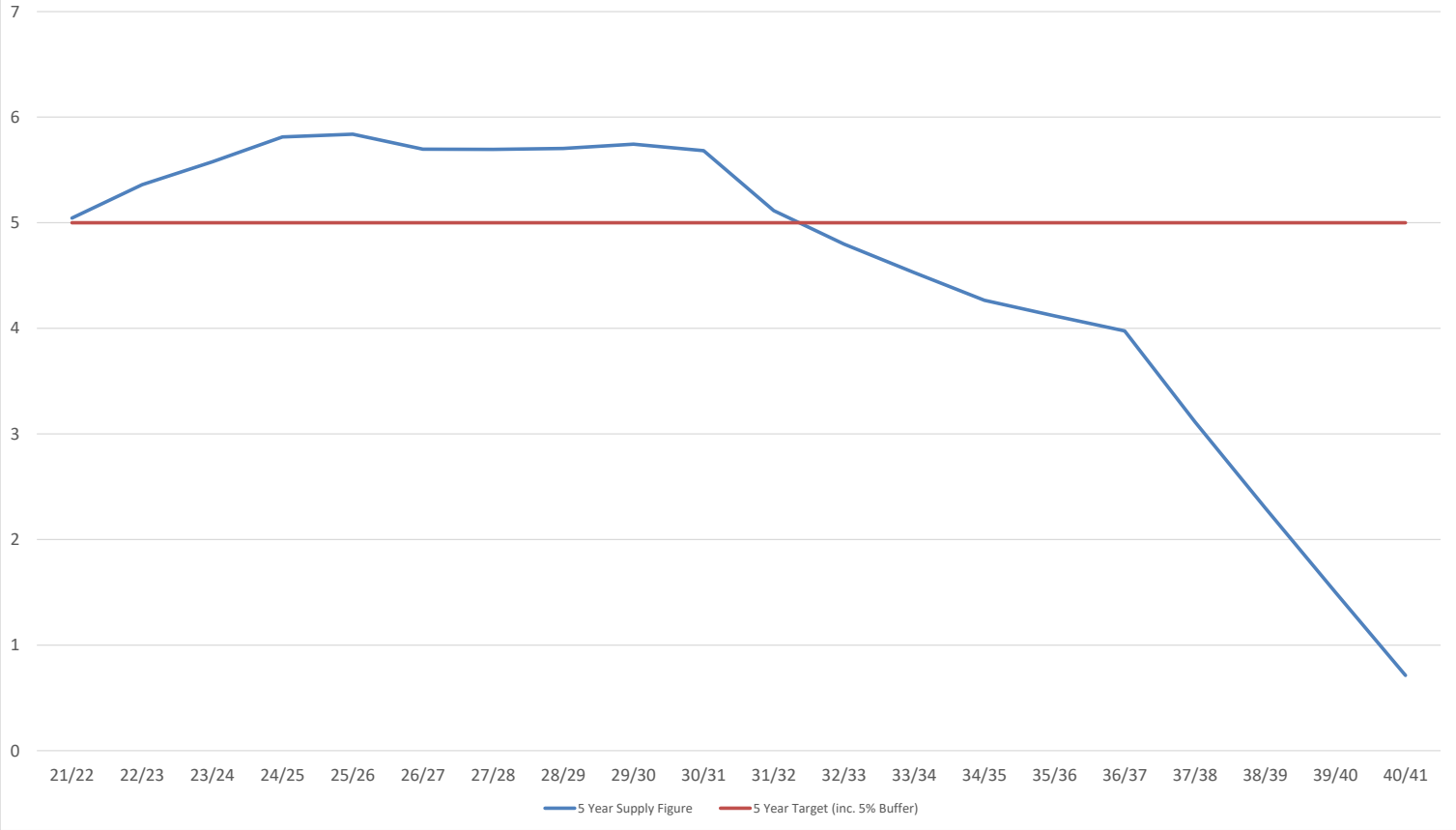
Five Year Housing Land Supply Graph